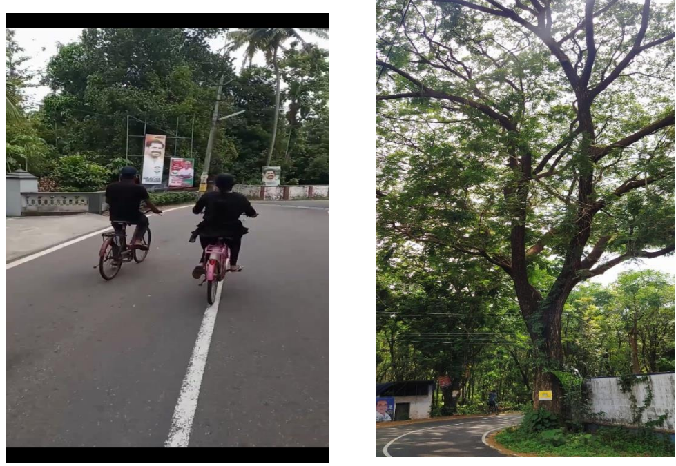
NSS Volunteers observing various trees as part of Tree Walk activities

The NSS volunteers of SCMS School of Engineering and Technology jointly conducted a tree walk to conserve trees on the roadside, prone to deforestation on 26<sup>th</sup> March 2021. An enthusiastic group of volunteers started their journey from our SSET (palissery) to koratty covering approximately 6kms in cycles. While on their way, students identified the trees, their biological name and species assigned to them and also took a count of the trees which need to be protected. Those trees will be provided with a nameplate and QR code assigned to them which will be covered in the 2<sup>nd</sup> phase of the Tree Walk session.